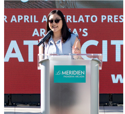
Olympian Mirai Nagasu

The State of the City address focused on upcoming projects and developments, fiscal responsibility, and community connections.