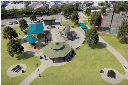
Newcastle Park renovation estimated completion, Spring 2025