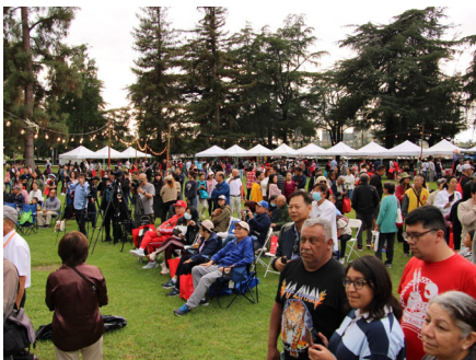
2023 Mid-Autumn Moon Festival

Nothing great is ever accomplished alone, and the Arcadia community has truly come together. Over the past year, Arcadia has hosted new and well-loved community events that foster relationships. These events include the Mid-Autumn Moon Festival and Lunar New Year Festival as well as co-sponsorship of the Halloween Haunting, the Holiday Fair, and the Patriotic Festival in Downtown Arcadia. Community partners like the Arcadia Chinese Association, Chamber of Commerce, and Downtown Arcadia Improvement Association make these events possible.