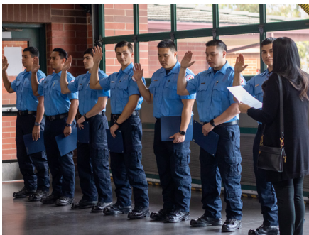
Swearing-in inaugural class of ambulance operators

Developments are essential for community growth and fiscal stability. Providing affordable housing ensures that residents of all income levels can call Arcadia home. Over the past year, several new mixed-use developments with affordable housing units have been approved, such as Alexan Azalea, Huntington Village, and The Derby Project. Residents will soon notice quieter neighborhoods as construction of the sound walls along the I-210 freeway has finally begun, a project made possible thanks to decades of persistent lobbying by former Arcadia mayors. By 2025, the five-story, 173-room Hilton Hotel project will be complete, creating new jobs and providing a welcoming place for visitors of major events like the Breeders' Cup.